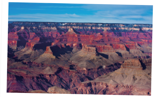
The colorful rock layers of the Grand Canyon