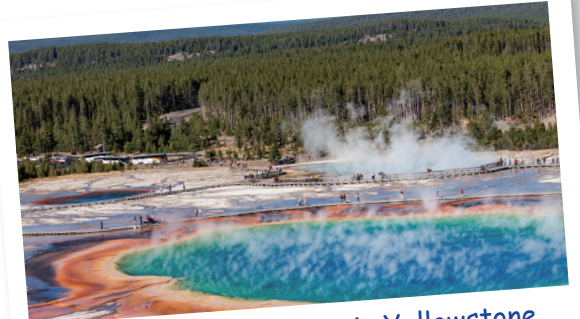
A rainbow hot spring in Yellowstone National Park

I think America is great! I hope you will visit my country one day.