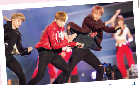
My friends can't help singing and dancing when they hear K-pop!