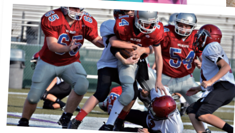
Football players wear helmets and shoulder pads to protect themselves.

watch amazing live shows. If you ever go to New York, I recommend \it The Lion King - it is a must-see show for kids!